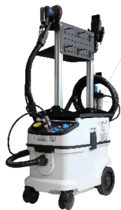
Trolley Series SNT202